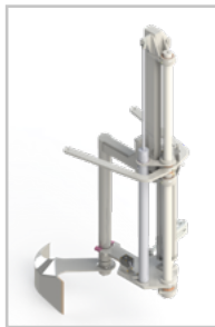
Floating Plough Design