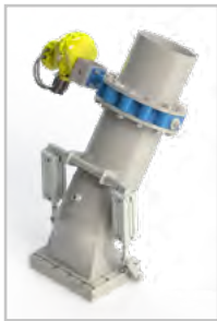
Dual Feed Valve System